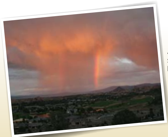
A typical Arizona sky after the rain