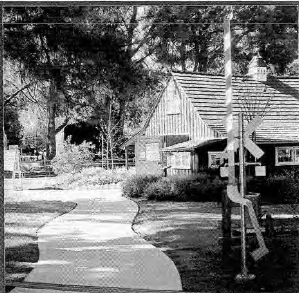
A new concrete path and 1/4 scale crossing guards have been provided by the Disney Family Foundation.