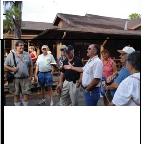
Carolwood members enjoy a tour of the Fort Wilderness Railroad right-of-way.