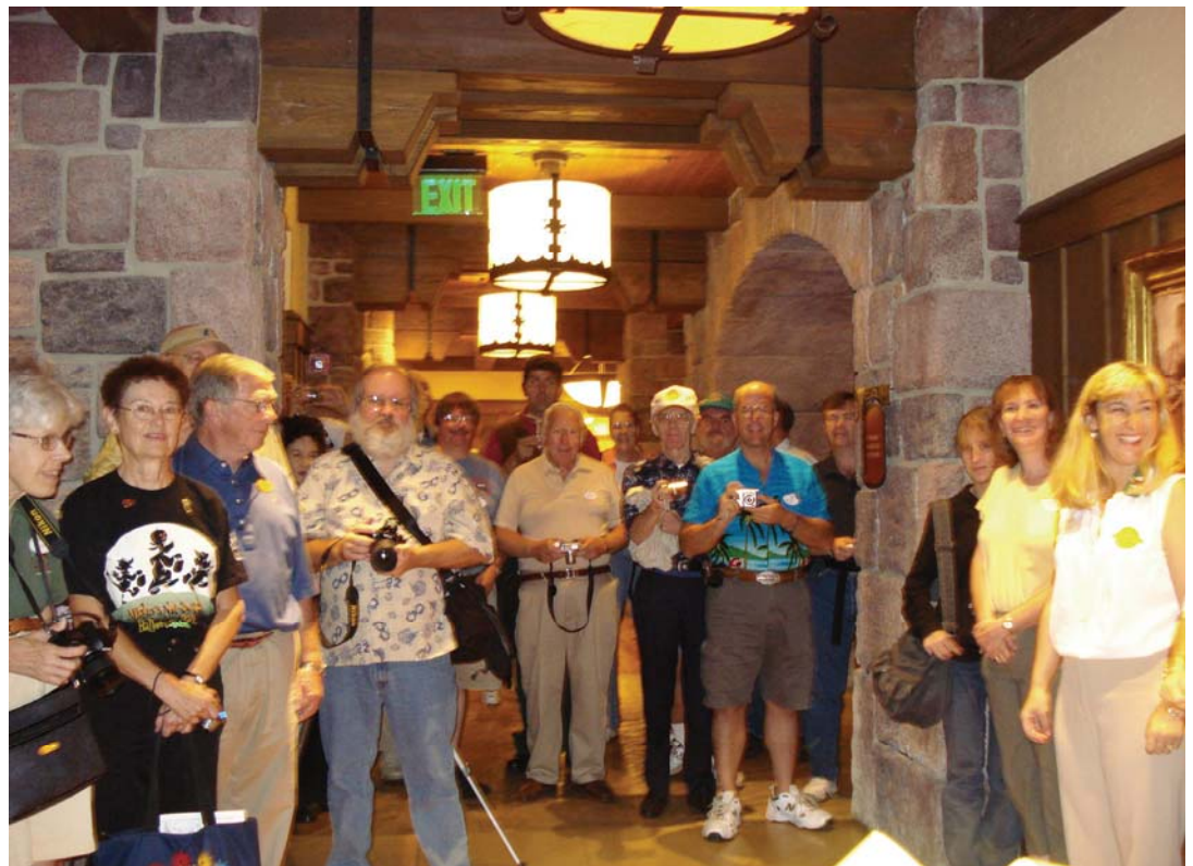
Members of the Carolwood Pacific Historical Society gather in the soon-to-be Carolwood Pacific Room at the Fort Wilderness Lodge Villas during the Un-Meeting in October 2007.