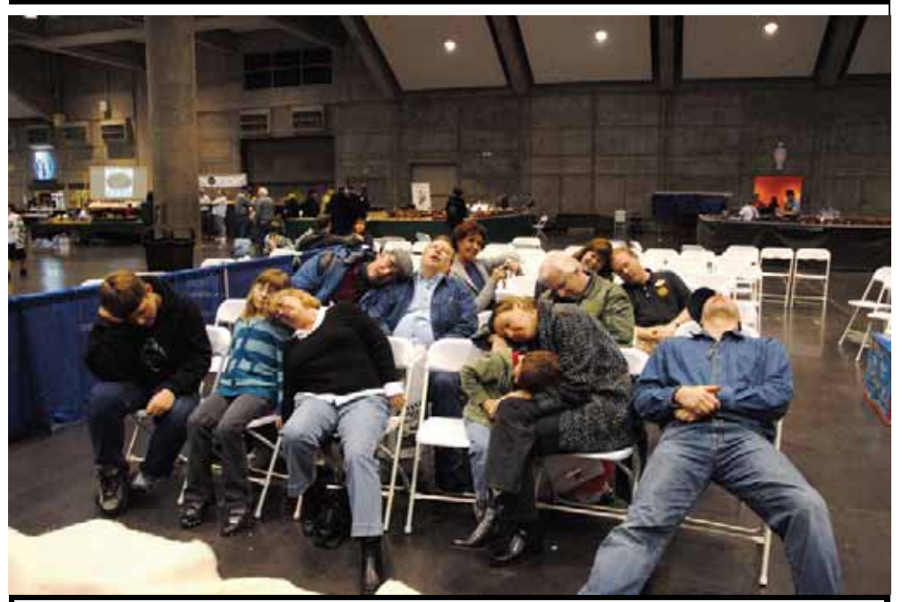
In Sacramento, CA, the third Disney presentation of that day did go just a little long..