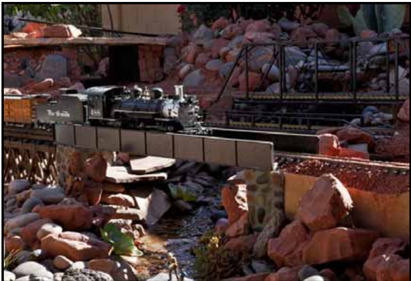
“Cottonwood Falls Railway”