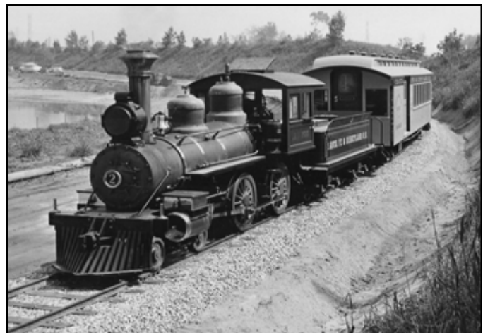
Walt Disney's favorite railroad coach the "combine car" is hauled behind then unnamed Engine No. 2 on a trial run during the building of Disneyland.

The Carolwood Foundation Board is exploring several options to fund the acquisition. Its members are adamant that Walt's favorite coach needs to be saved because it's an important part of railroading and Disney history and should be preserved for posterity as is Walt's beloved Barn thanks to his family and the Carolwood Pacific Historical Society.