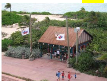
The flags fly at half-mast in Castaway Cay for Roy Disney.