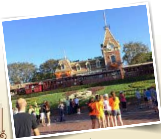
Left: Carolwood members gather in front of Main Street Station for the start of the UnMeeting festivities