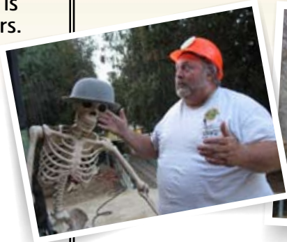
Left: What has the Superintendent so surprised?