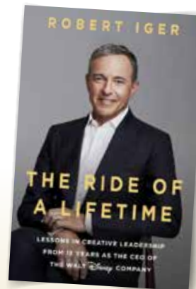
"Ride of a Lifetime" by Disney Chief Bob Iger

Published by Random House (not Disney), his straightforward tome chronicles the many challenging obstacles he overcame, such as having a degree from an undistinguished college in northern New York