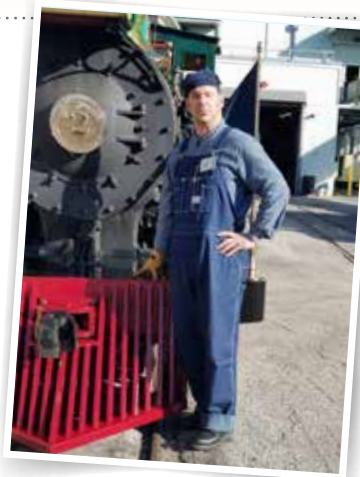
Me with the Lilly Belle on the steam tour

just got away! (I did ride the Casey Jr and I loved it, tho!