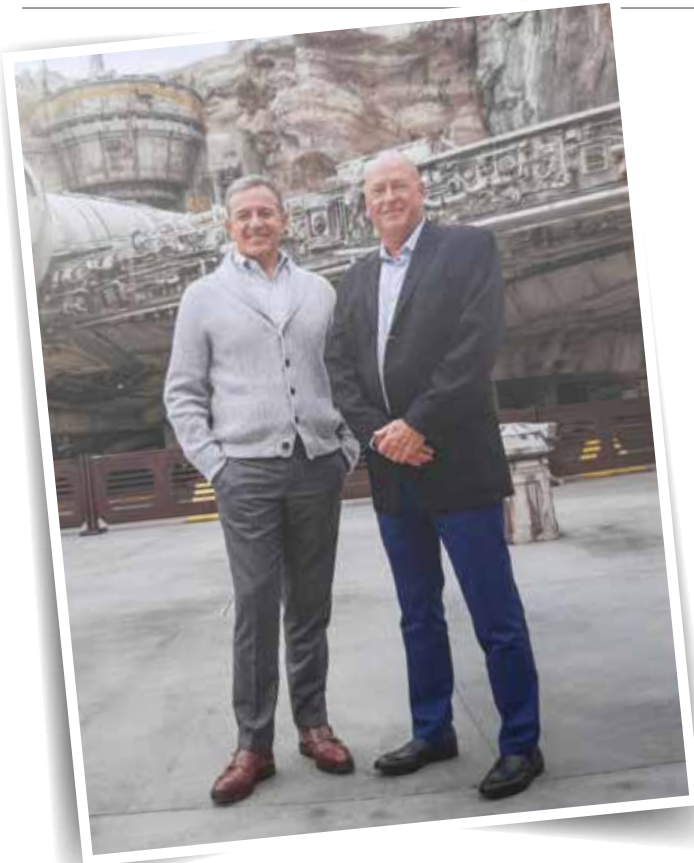
Disney CEO Bob Iger and his successor Bob Chapek

A n unexpected seismic shift in the leadership of The Walt Disney Company caught 220,000 Cast Members, millions of shareholders and the financial media by surprise on February 25 when Bob Iger announced, effective immediately, Bob Chapek as his successor to be chief executive officer of the global entertainment empire.